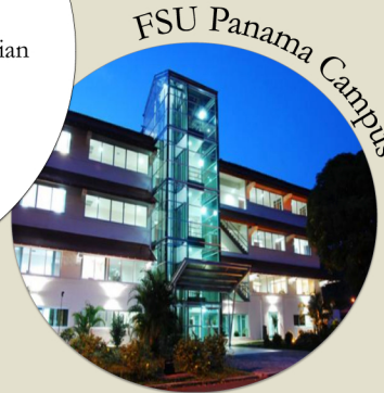
FSU Panama Campus