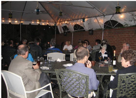
Leaders and Luminaries