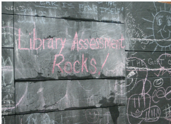
Charlottesville Free Speech Wall